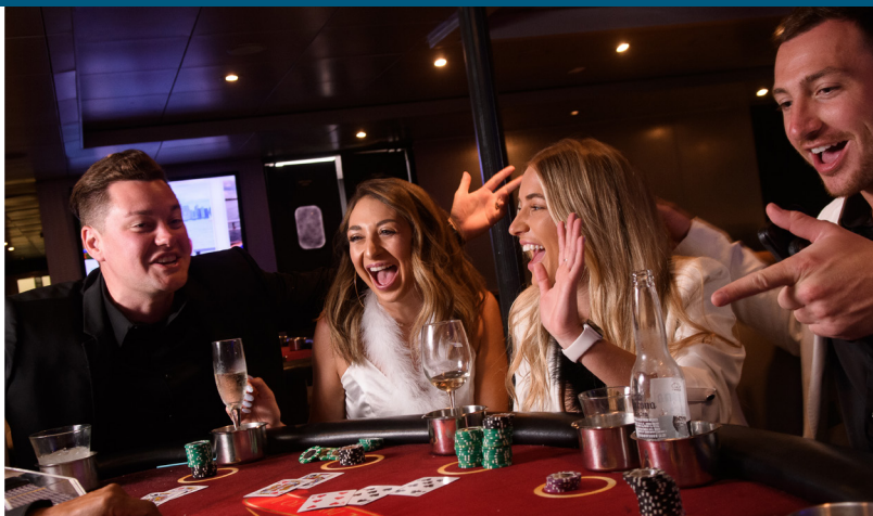
Landman Bash attendees enjoyed playing casino games on the yacht.