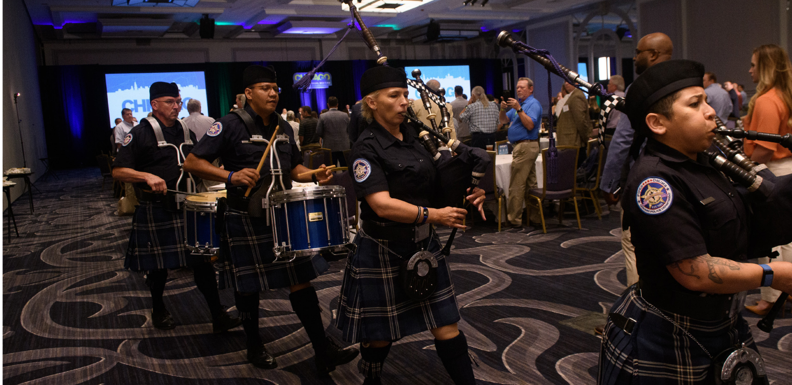
Members of the Honor Guard and the Pipes and Drums of the Chicago Police Department marched into the ballroom playing patriotic music at the start of the Annual Meeting.