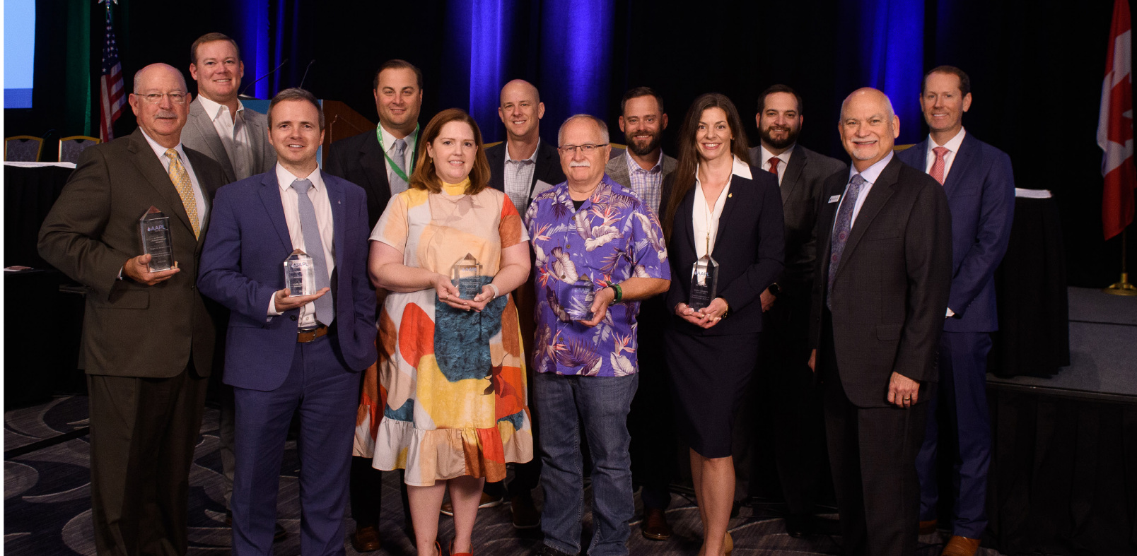
2022-23 AAPL Award Winners