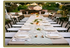
FALL LUNCHEONS Seth Blackwell