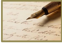
PRESIDENT'S NOTE Travis Beavers